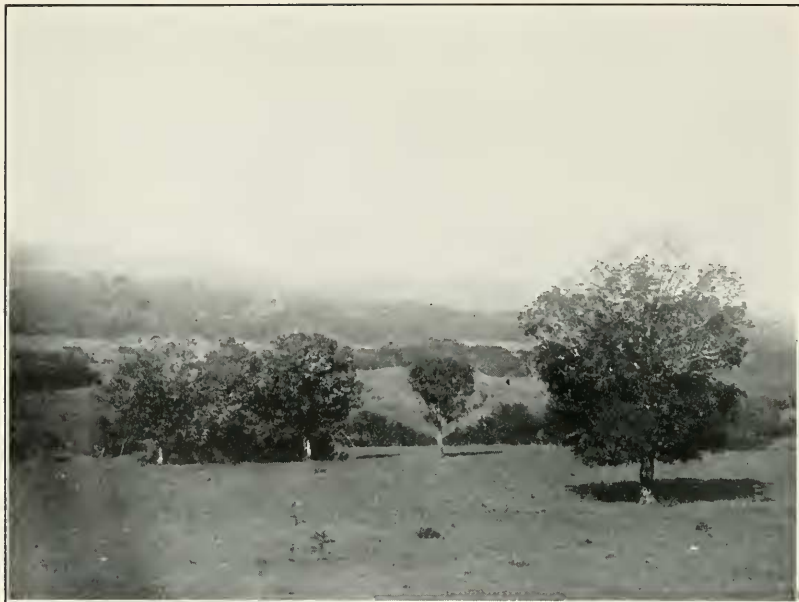
ROLLING UPLAND. Near Las Cahobes, Haiti, May 20, 1931.